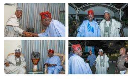
9:27 am · 21 Feb 20 · Twitter for Android

In February 2020, Tinubu and Ganduje, the Kano governor, discussed the future of the Emir of Kano, Sanusi